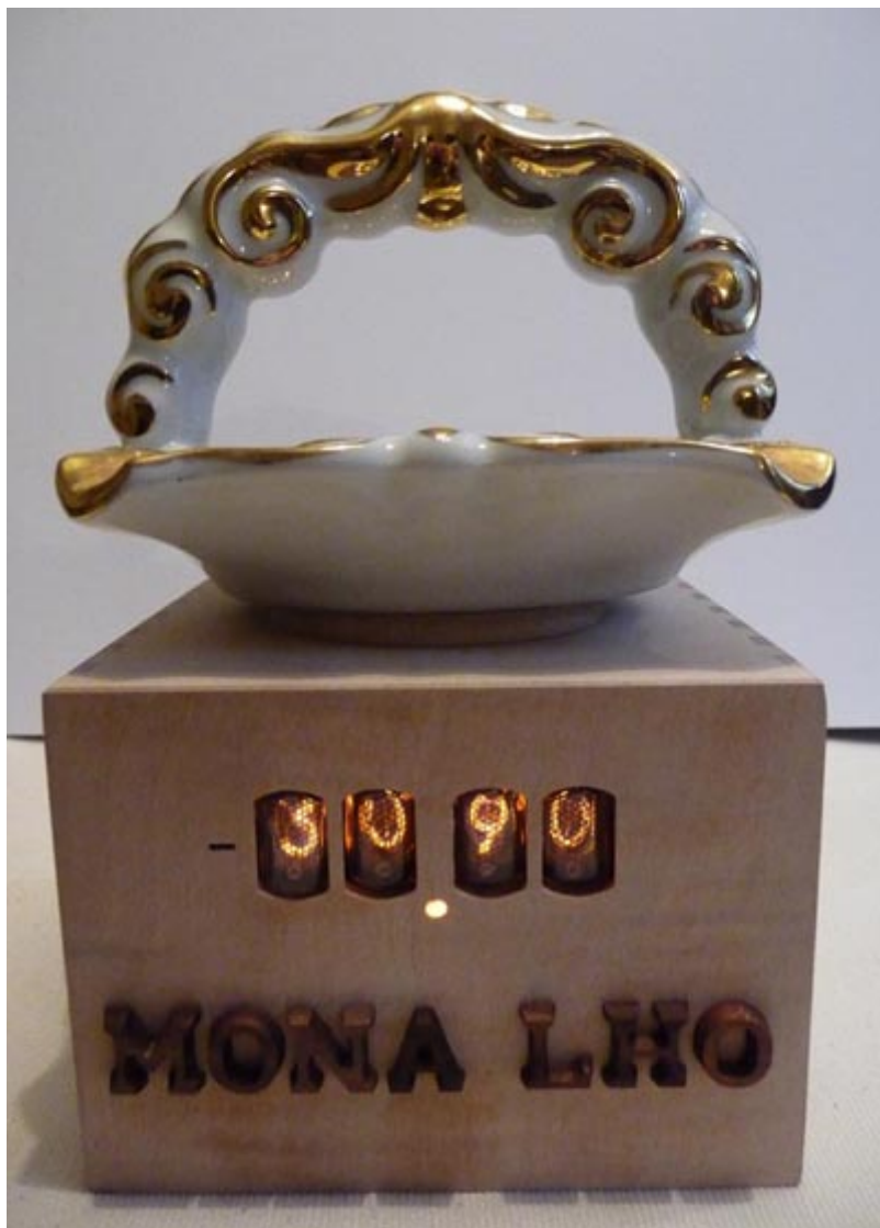
Closed-up of Nixie Tubes on Mona LHO