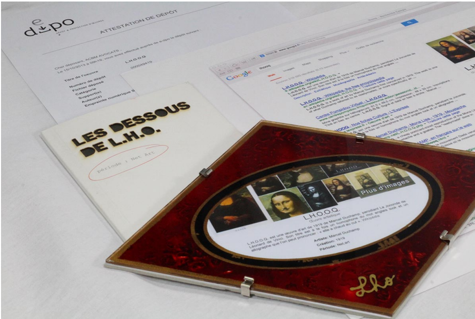
The full set