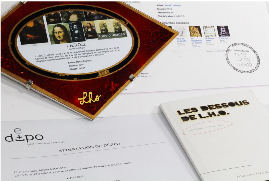
The full set