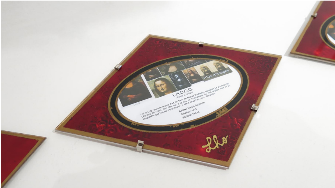
The Innards of L.H.O. frame