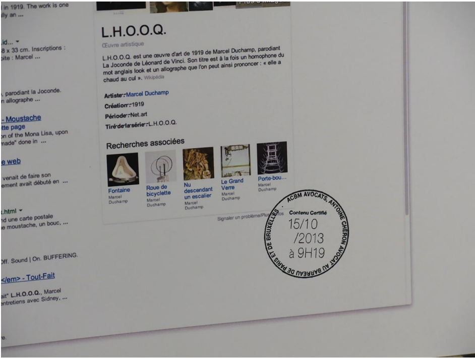
Detail of Layeurs valdiation