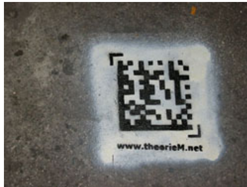
a 2D code

2006 Festival Traverse vidéo - Abattoirs de Toulouse - Toulouse, France