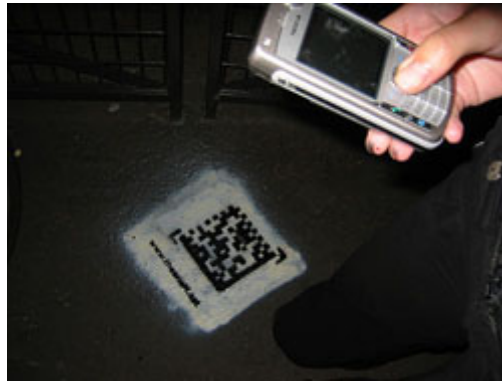
The phone capture the 2D code