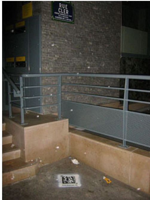
A 2D code at a street corner